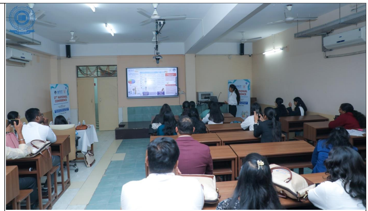
Scientific sessions held at respective venues