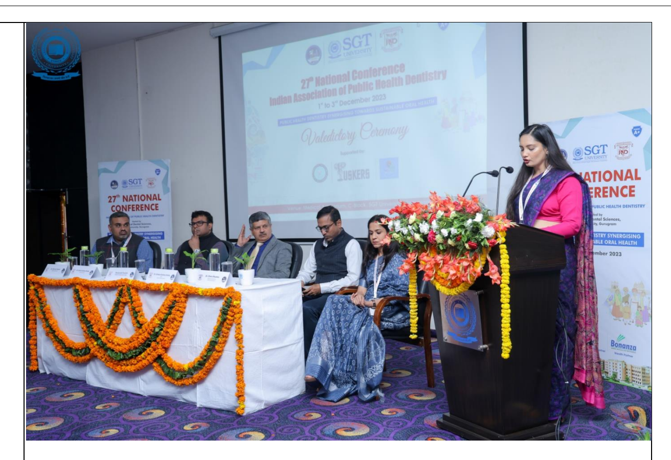
Valedictory ceremony of conference