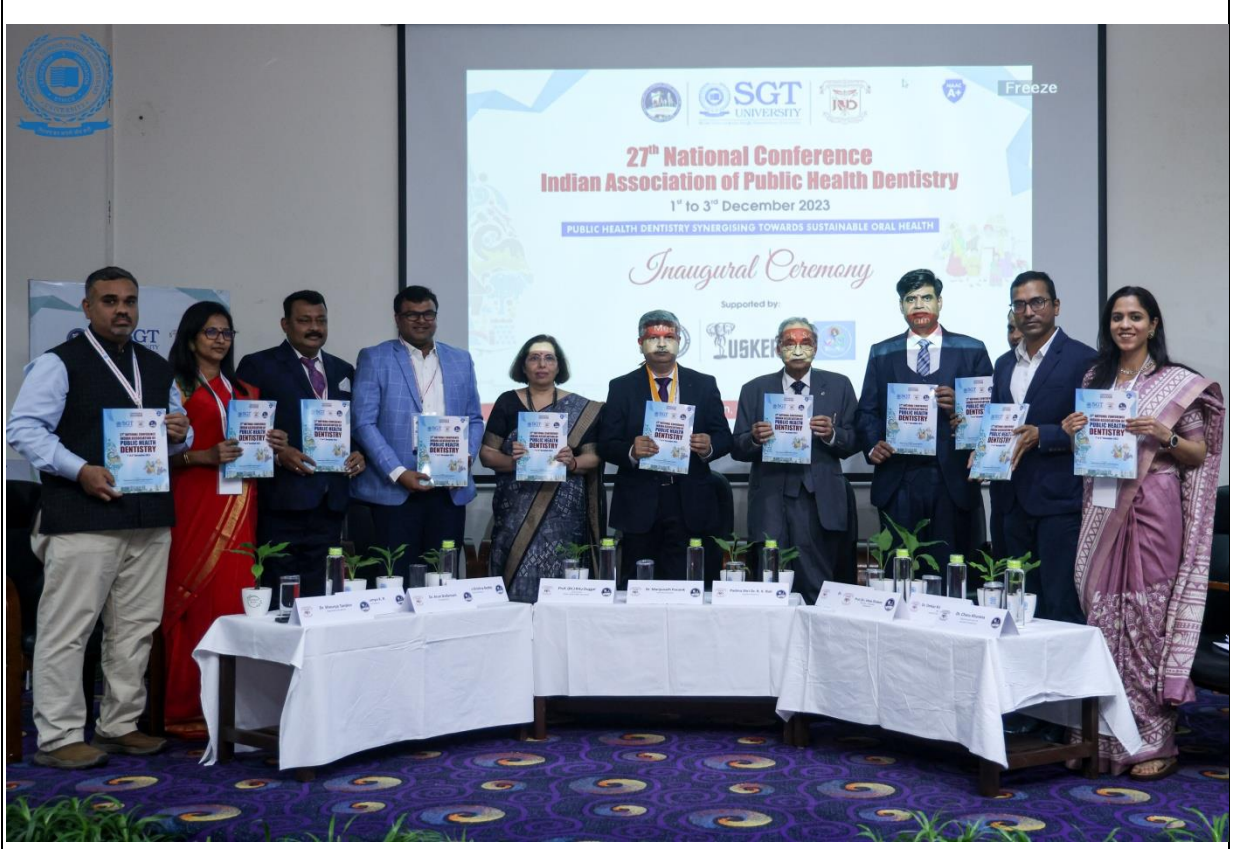
Release of souvenir in inauguration ceremony at conference