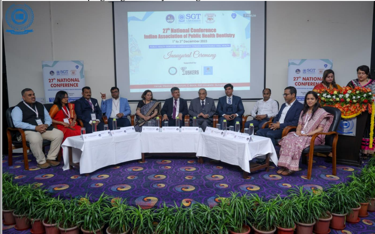
Honorary members along with organizing chairman, organizing secretary, scientific chairperson of conference

Lamp lighting ceremony in inauguration event of conference